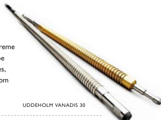
UDDEHOLM VANADIS 30

A broach made of steel designed to cut other steel has to withstand extreme strain. The sharp edge needs to last a long time and the material has to be highly durable. Friction against the broach can generate high temperatures, which the material must resist. An extremely pure, high-alloy PM steel from Uddeholm High Performance Steel meets these demands.